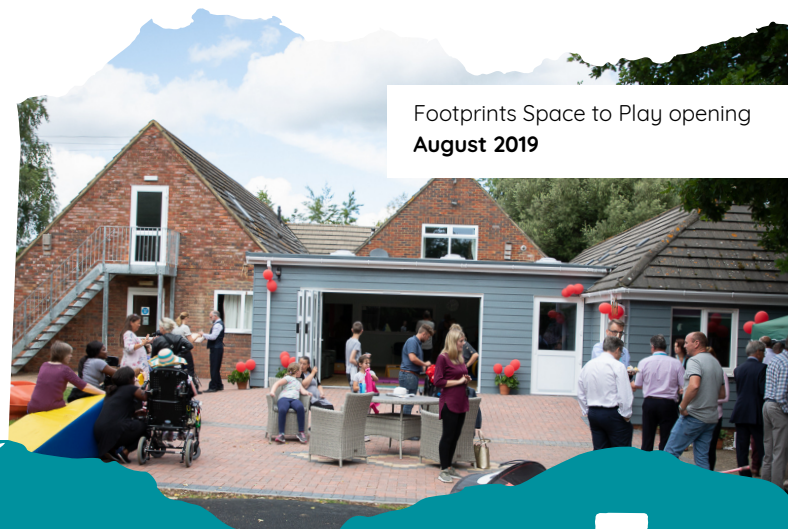
Footprints Space to Play opening August 2019