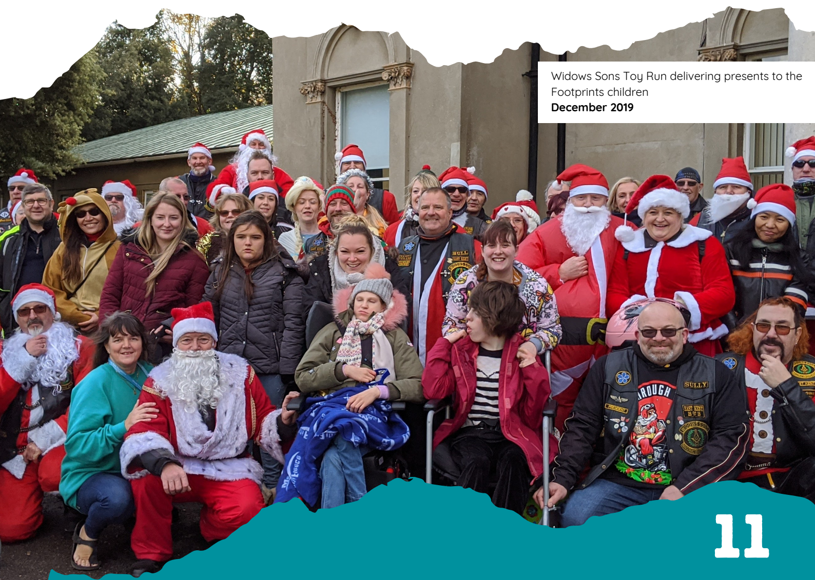
Widows Sons Toy Run delivering presents to the Footprints children December 2019

Ashford Commercial Quarter 1 Dover Place, Ashford, Kent TN23 1FB