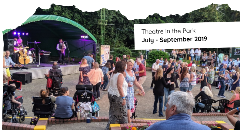
Theatre in the Park July - September 2019